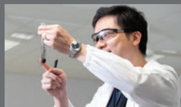
Researching for Better Teaching