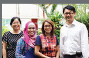
Research as Professional Growth