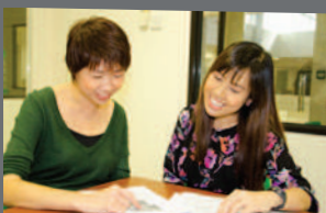
Opening Doors with Research