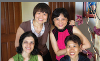
Growing as a Group