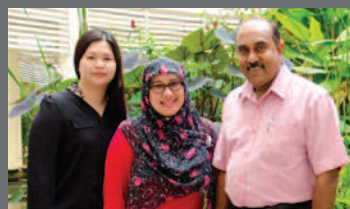
From Conversations to Research